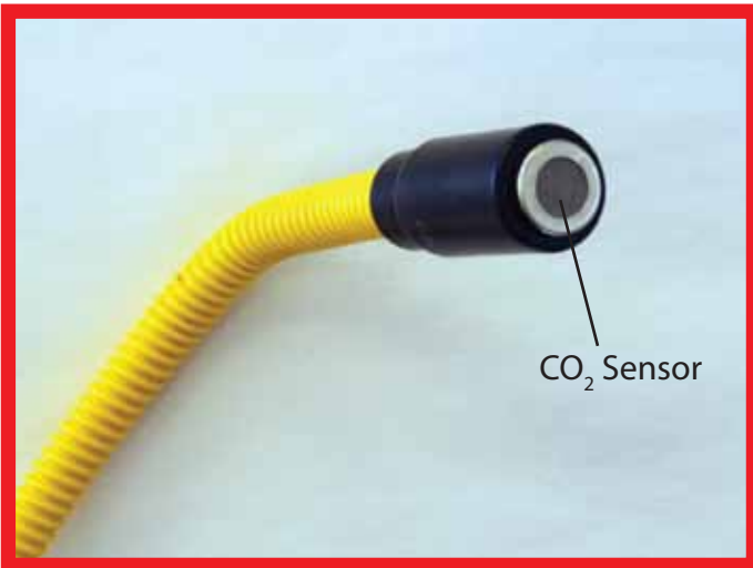
CO 2 Sensor